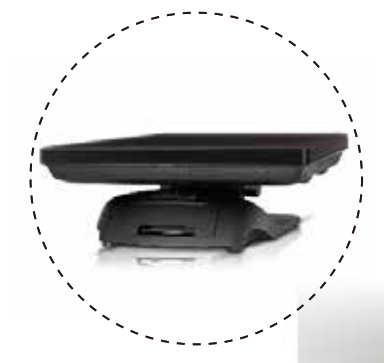
Low Profile Mode